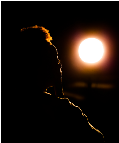
Color Digital by Brian Boardman