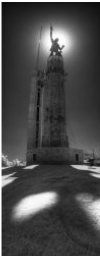
Monochrome Digital by Garth Fraser